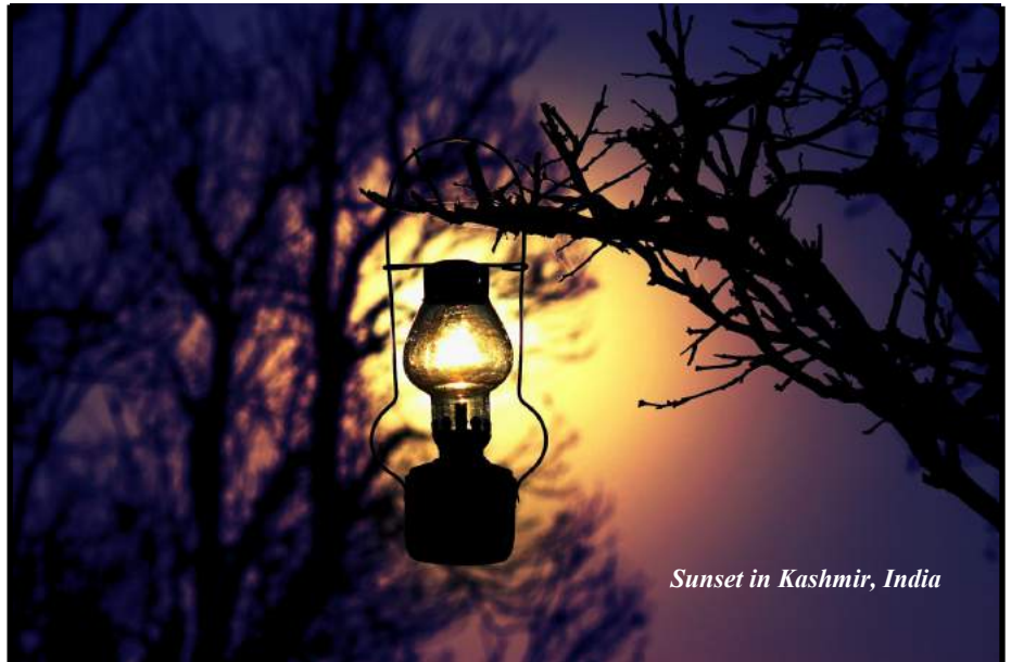
Sunset in Kashmir, India

Buffet Lunch/Lecture March 24, 2020 11:30 am $25